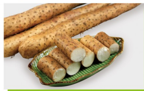
保鲜山药 Fresh Yam