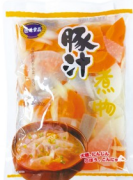
豚汁 300g Tonjiru