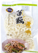
莲藕 250g Lotus Root