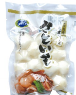
水煮芋 150g Boiled Taro