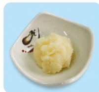
冷冻蒜泥 Frozen Garlic Paste