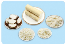
冷冻山药制品 Frozen Yam Products