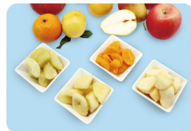
冷冻水果 Frozen Fruits