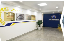
企业荣誉 Company honor