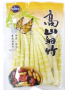
高山细竹 250g Boiled thin bamboo shoots