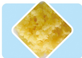
冷冻姜丁 Frozen Ginger Dice Cut