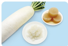
冷冻大根制品 Frozen Radish Products