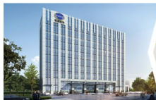
检测楼 Inspection building