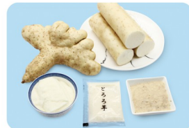
冷冻山药制品 Frozen Yam Products