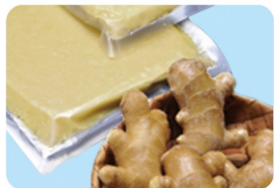
冷冻姜泥 Frozen Ginger Paste