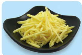
冷冻姜丝 Frozen Shredded Ginger