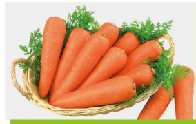
保鲜胡萝卜 Fresh Carrot