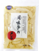
調味笋片 250g Seasoning bamboo shoots