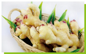
保鲜生姜 Fresh Ginger