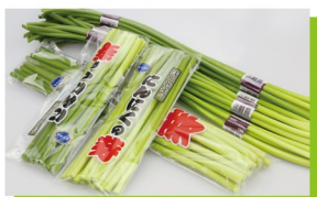
保鲜蒜苗 Fresh Garlic Sprouts