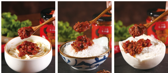
鲜椒牛肉酱 (块大) 礼盒