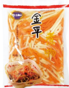
金平 300g Kinpira