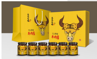
鲜椒牛肉酱 (一瓶好酱) 礼盒