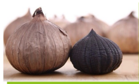
黑蒜 Black Garlic