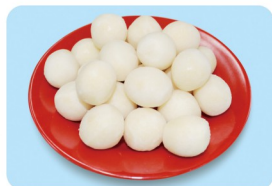
冷冻芋头 Frozen Taro