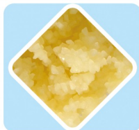
冷冻蒜丁 Frozen Garlic Dice Cut