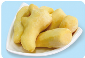
冷冻姜块 Frozen Ginger