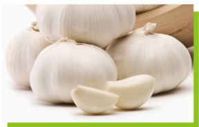
保鲜大蒜 Fresh Garlic