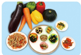
冷冻调理蔬菜 Frozen Seasoned Products