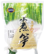
水煮笋 230g Boil bamboo shoots