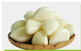
保鲜蒜米 Fresh Peeled Garlic