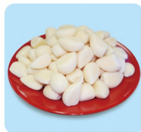
冷冻蒜米 Frozen Garlic